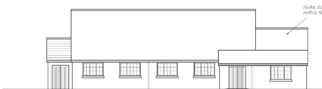
Proposed north west elevation.

Household questionnaire to all West Down residents to understand need for extended parish hall in preparation for further grant applications