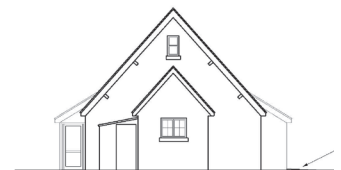
Proposed north east elevation.

Photovoltaic panels to provide electricity towards heating the hall.