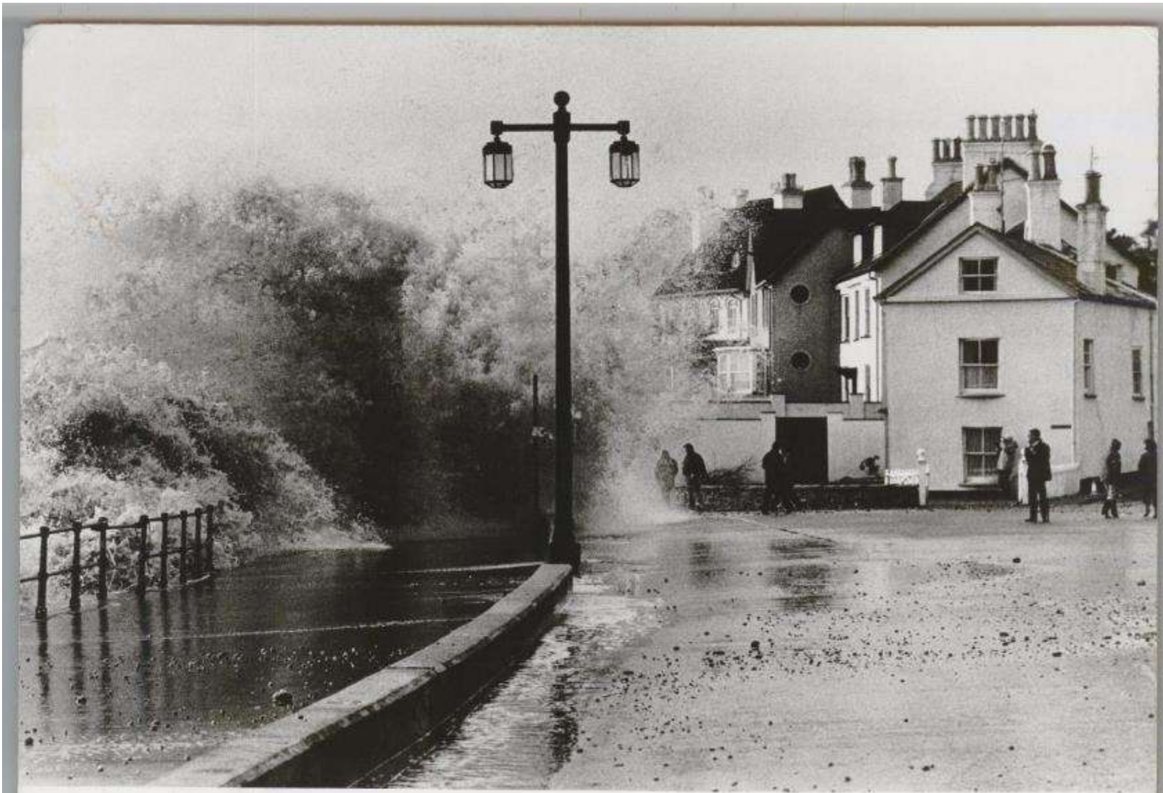
SEA FRONT, SIDMOUTH 17 DECEMBER 1989