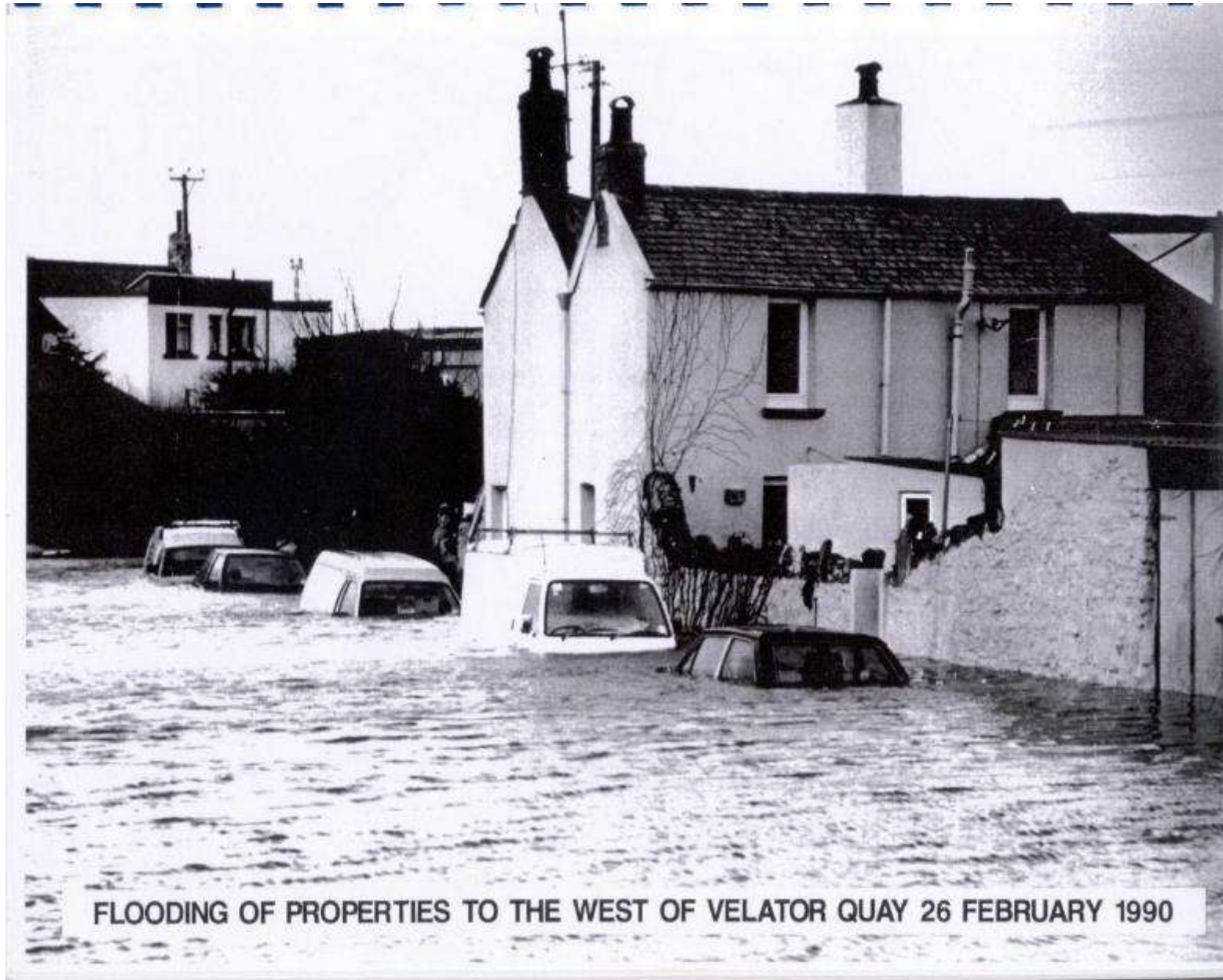
FLOODING OF PROPERTIES TO THE WEST OF VELATOR QUAY 26 FEBRUARY 1990