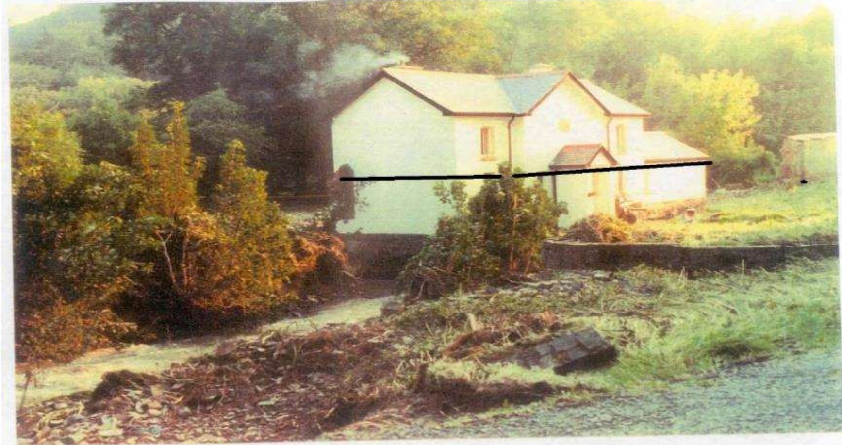
Jewell Cottage SS 666 185