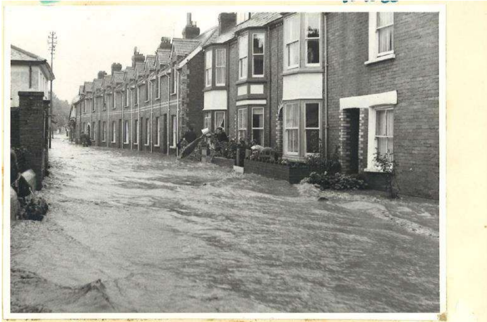
5. Mill Lane looking North, Sidmouth.