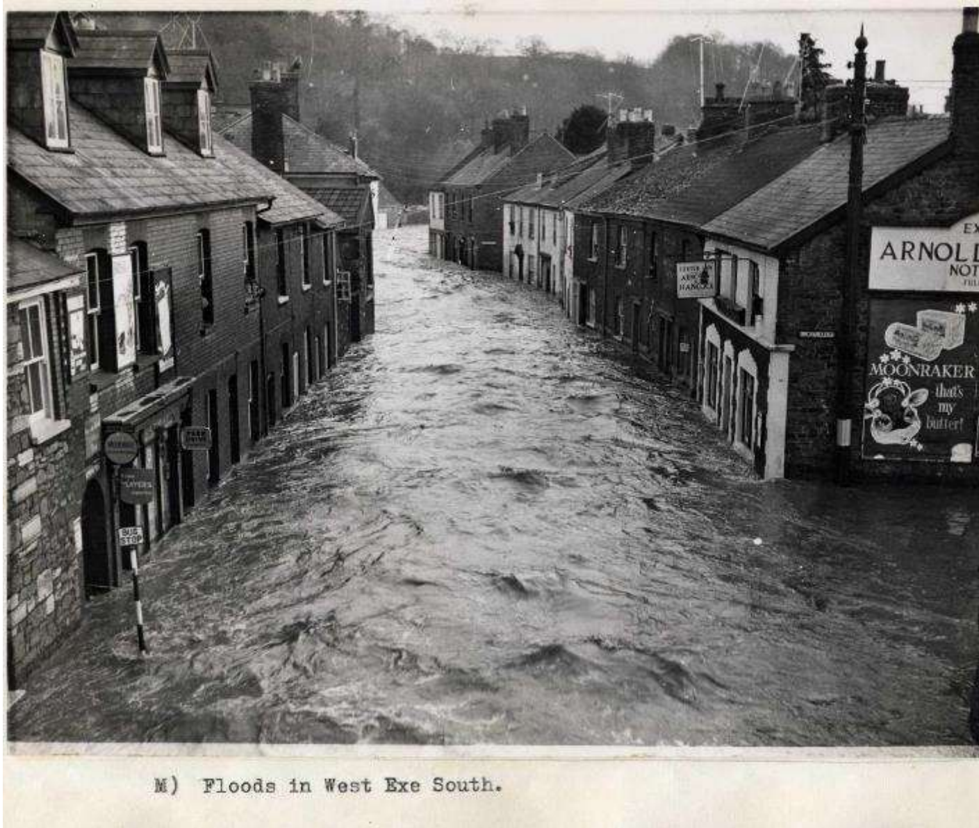
M) Floods in West Exe South.