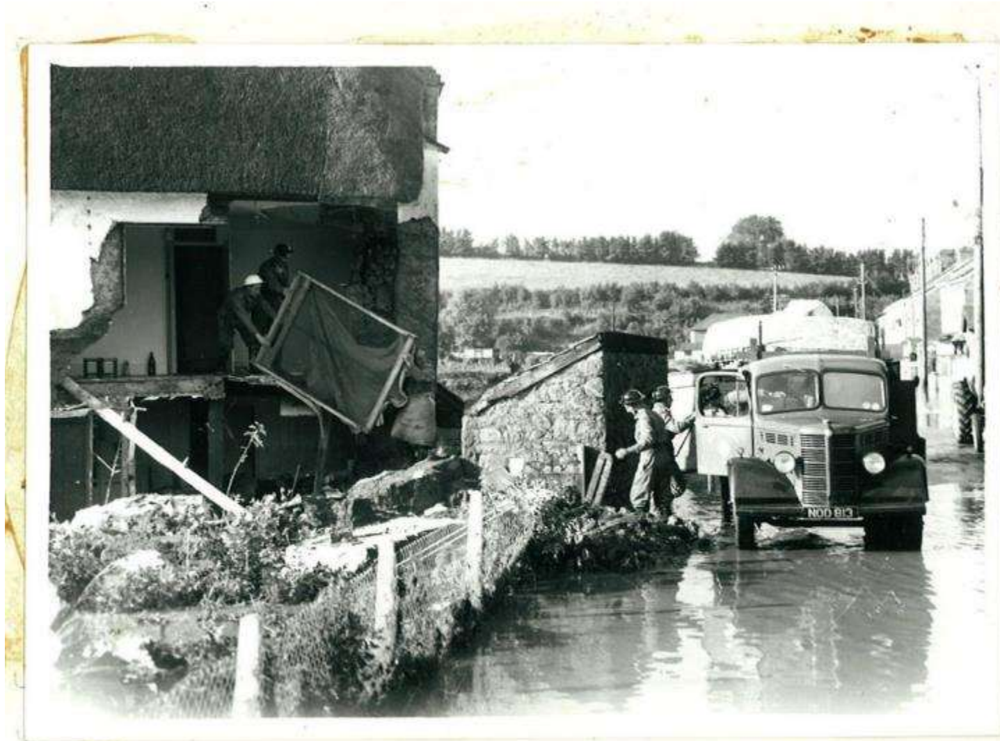
14. Main Street of Fordton after 1960 Floods