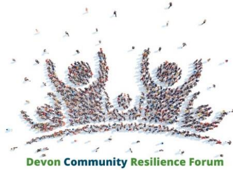
Devon Community Resilience Forum