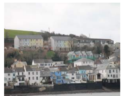
The mount, Appledore