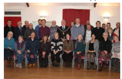
Cheriton Bishop CLT celebrate their new homes