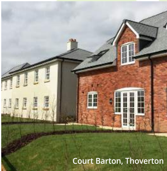
Court Barton, Thorverton