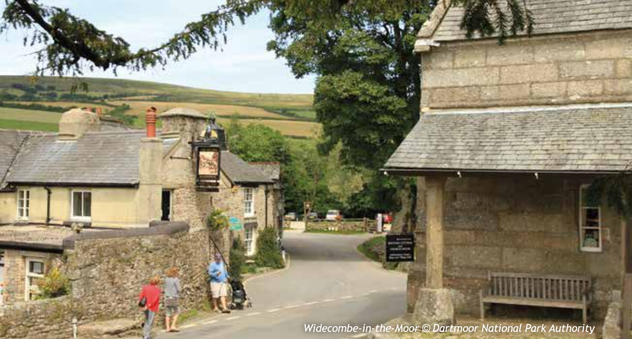
Widecombe-in-the-Moor

country over for its famous Widecombe Fair. Its current community building is the National Trust-owned Church House which, although picturesque and much-loved, is not accessible, has limited parking and is difficult to heat. That's why in the last year a group of enthusiastic community members has begun the process of developing a new hall.