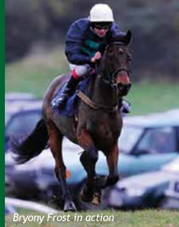
Bryony Frost in action

When first asked if she would become an ambassador for Devon Communities Together's Love Devon campaign, National Hunt Racing's rising star Bryony Frost answered with a resounding yes. Why? Quite simply because she loves Devon and its village and community life.