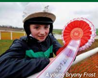
A young Bryony Frost

“We're incredibly lucky to have Bryony on board for our LOVE Devon campaign and we're looking forward to her support at events here in Devon whenever she's not off conquering the racing world! We're especially thrilled that she shares our passion for Devon's communities and is willing to lend her support to the work we're doing all over Devon to help communities help themselves.”