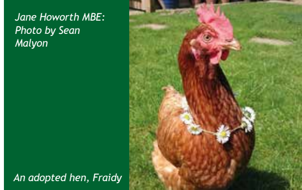
An adopted hen, Fraidy

"I realised there was nobody out there doing anything for these poor little creatures. They were out of sight, out of mind and I could do so much more."