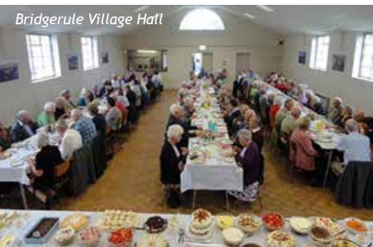
Bridgerule Village Hall

It's surely success stories like these that inspire other communities to modernise their own community buildings. Take Widecombe-in-the-Moor for example - an iconic Dartmoor village that's known the