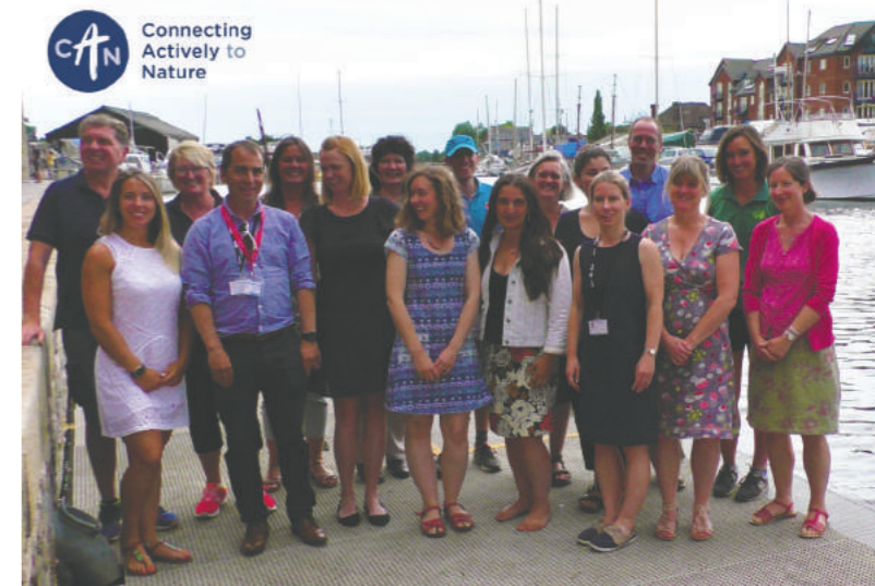
Connecting Actively to Nature partners

DCT OBJECTIVE COMMUNITIES BECOME HEALTHIER, MORE VIBRANT AND INCLUSIVE WITH IMPROVED WELLBEING