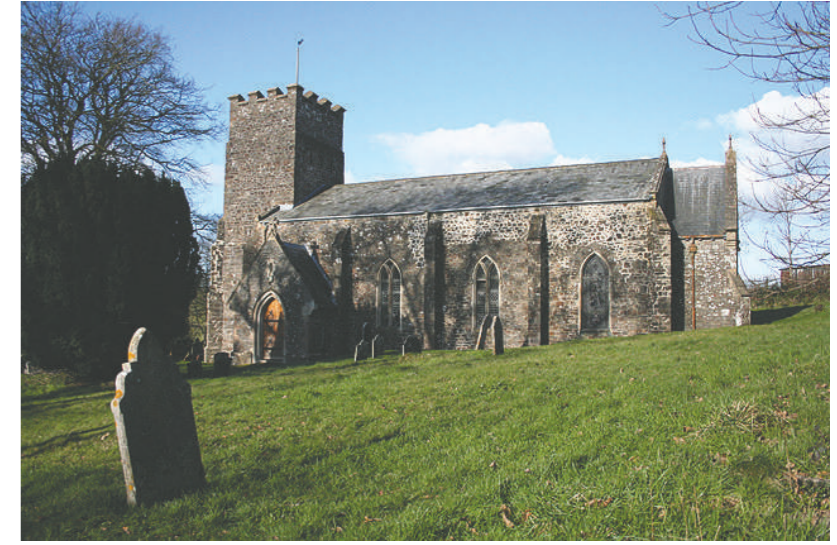
St John the Baptist Church, Meshaw, North Devon