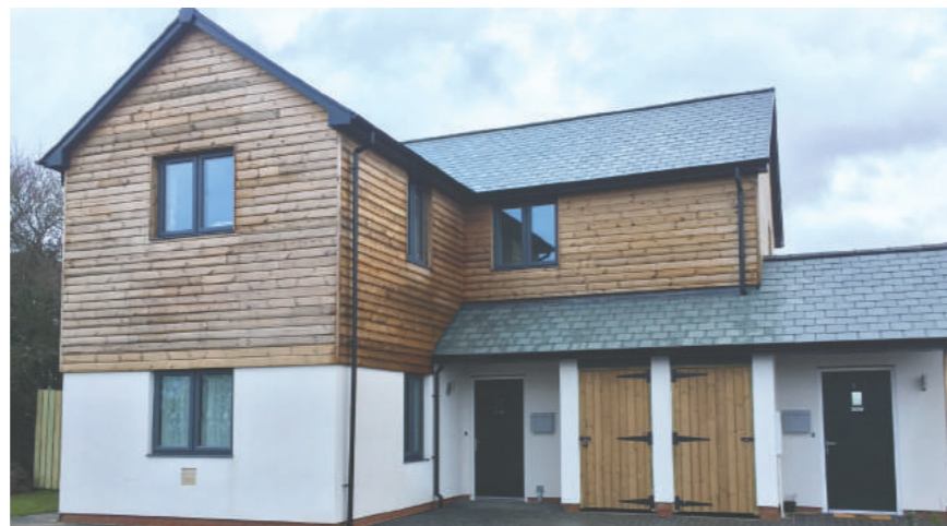
Affordable homes for rent in Cheriton Bishop

DCT OBJECTIVE COMMUNITIES BECOME HEALTHIER, MORE VIBRANT AND INCLUSIVE WITH IMPROVED WELL BEING