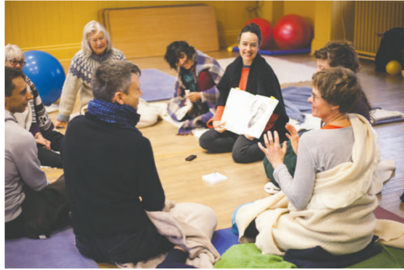
The School of Experiential Learning: a Body-Mind Centering Workshop